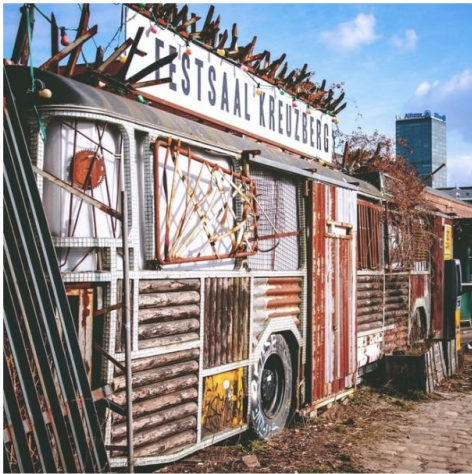
Subculture and Art Tour